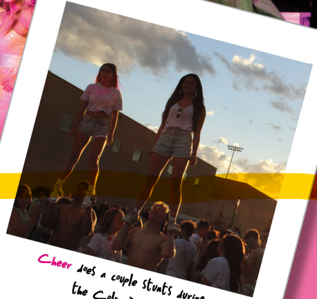
Cheer does a couple stunts during the Color Dance. Color Dance on page 9