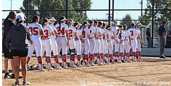
3A State tournament