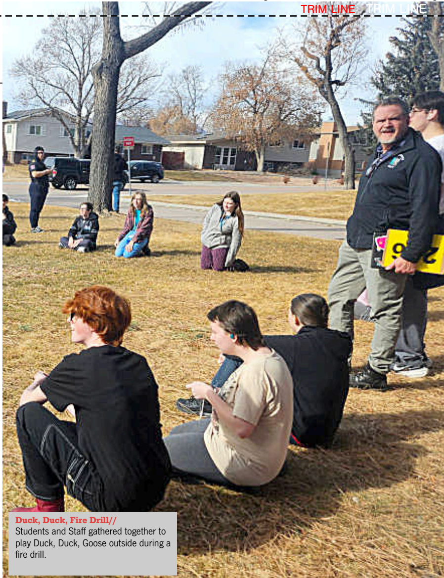
Duck, Duck, Fire Drill// Students and Staff gathered together to play Duck, Duck, Goose outside during a fire drill.