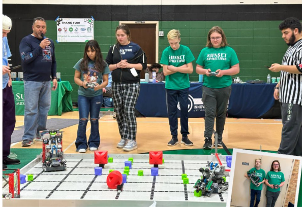
2nd place for Teamwork Championship Duo