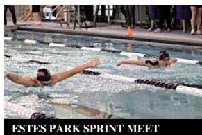
ESTES PARK SPRINT MEET

On January 18 the girls competed at Estes Park. Pictured above is their starting positions and below that their practice laps before the meet starts.