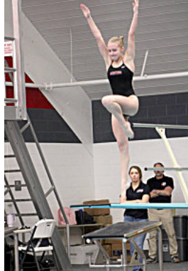
Diving