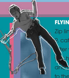
COOPER MCKINNON, 9

FLYING THROUGH THE AIR Zip lining, Cooper Mckinnon, 9, catches the rope. "Right after you're done zip lining, you have to grab the rope and pull the zip line back up to the top safely," Mckinnon said.