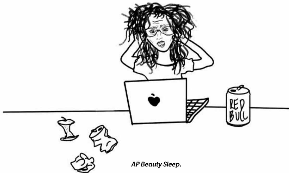
AP Beauty Sleep.