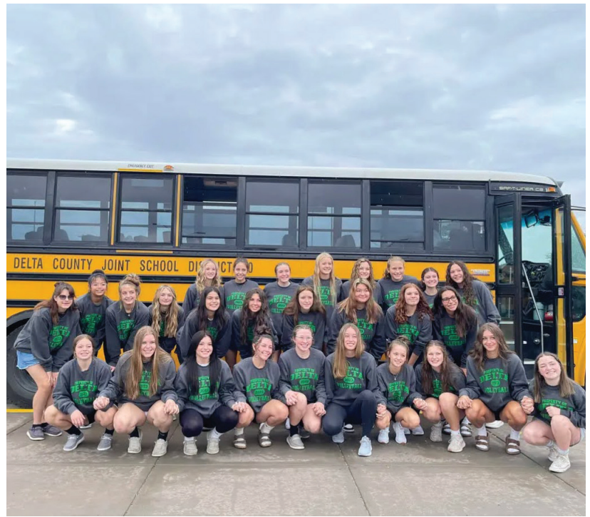
Delta volleyball leaves for a game last season.

The new season has many unexpected things and there's no saying what the season will bring having a new coach and the many changes there will be.