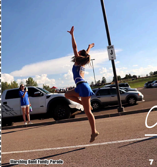
Marching Band Family Parade