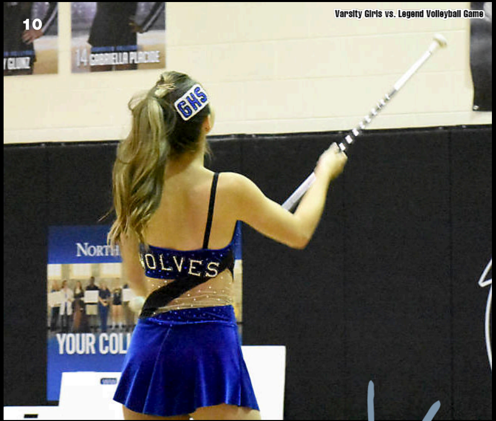
Varsity Girls vs. Legend Volleyball Game