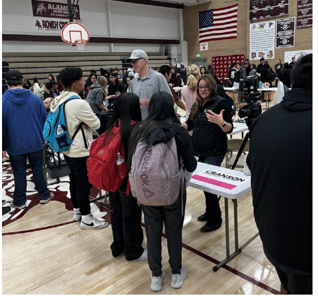
LEARN FROM THE BEST

Students stop and talk to various teachers and workers to learn more about their job.