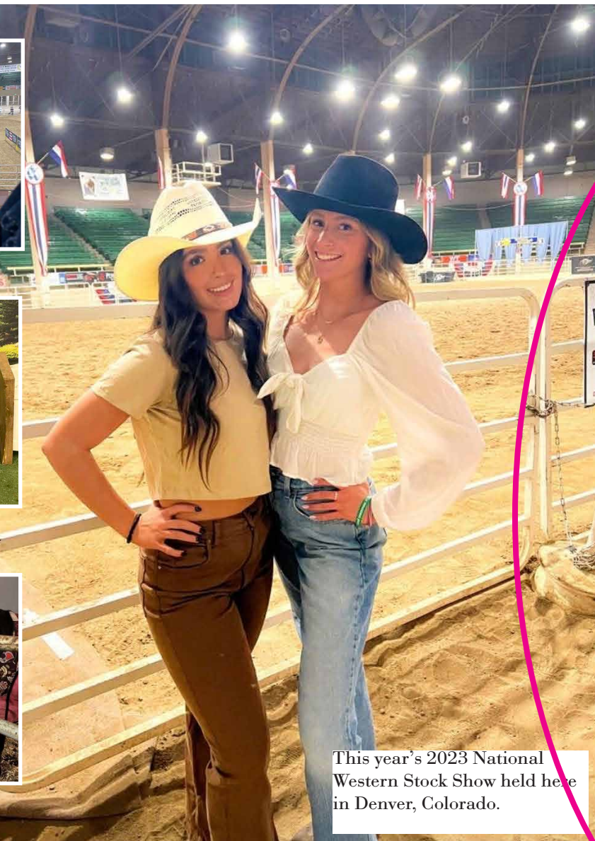
This year's 2023 National Western Stock Show held here in Denver, Colorado.