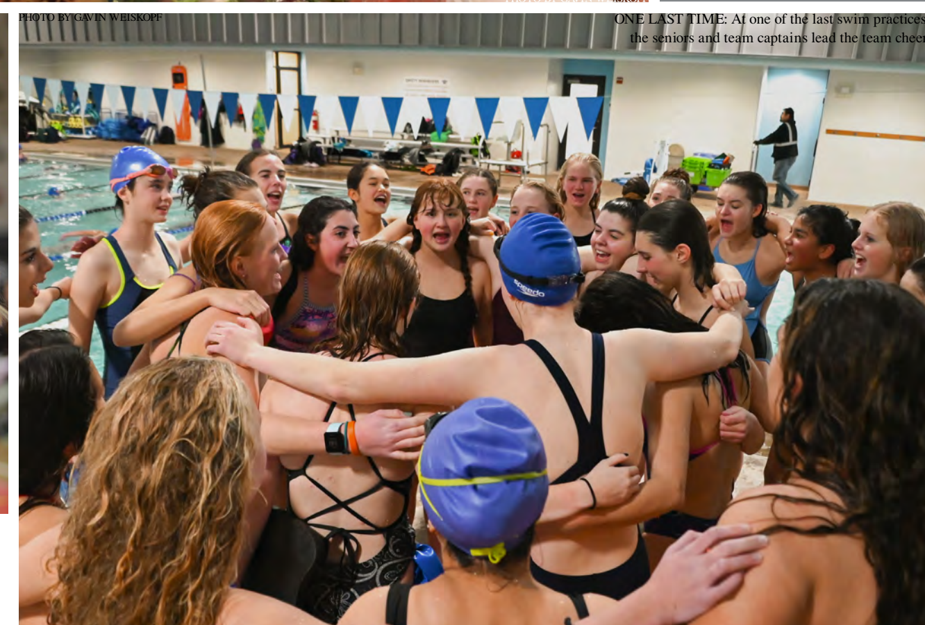
ONE LAST TIME: At one of the last swim practices, the seniors and team captains lead the team cheer.