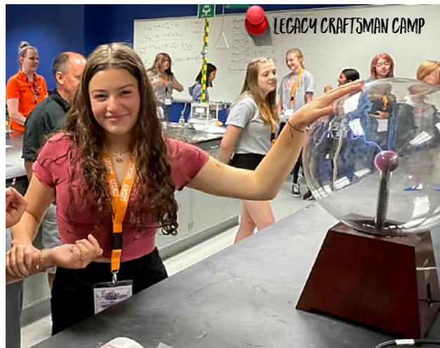
LEGACY CRAFTSMAN CAMP