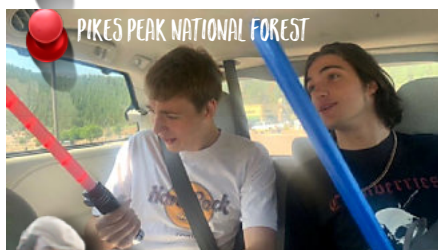
PIKES PEAK NATIONAL FOREST