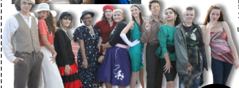
Coronado Theatre Students strut the runway at the D11 150 year celebration. SESQUICENTENNIAL

For it or against it, the court ruling has certainly sparked discussion and given people something to think about for years to come.