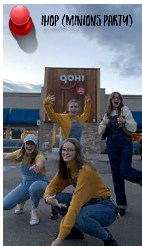
IHOP (MINIONS PARTY)