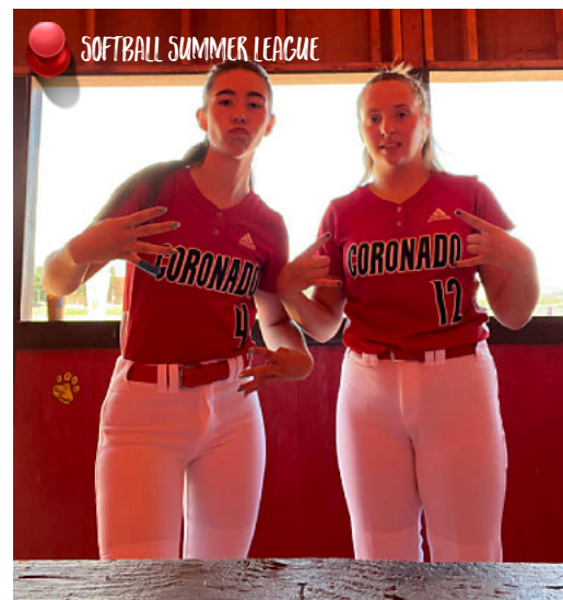
SOFTBALL SUMMER LEAGUE