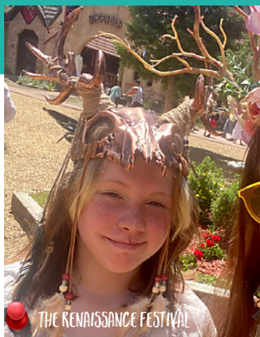
THE RENAISSANCE FESTIVAL