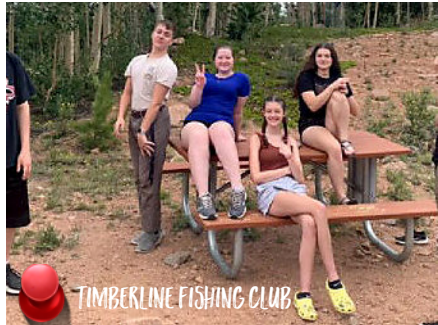
TIMBERLINE FISHING CLUB