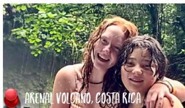
ARENAL VOLCANO, COSTA RICA