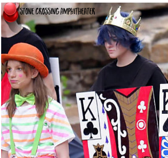
STONE CROSSING AMPHITHEATER