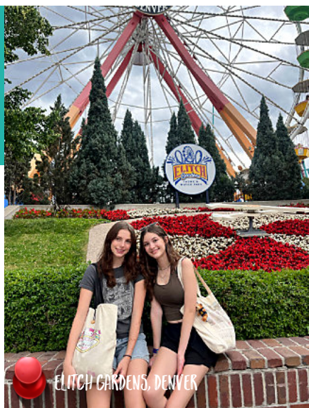
ELITCH GARDENS, DENVER

It's great to have such inclusion in Colorado Springs and at Coronado!