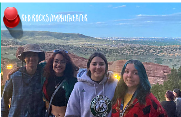
RED ROCKS AMPHITHEATER