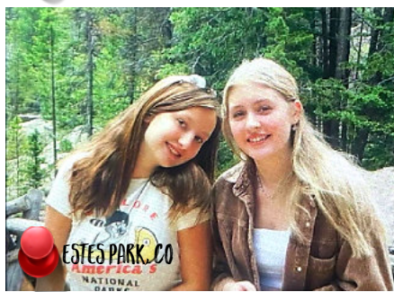
ESTES PARK, CO AMERICA'S NATIONAL GAME PRESERVE