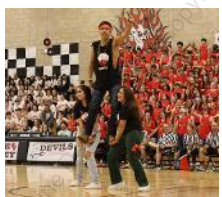
We Will Rock You- Queen

SHINE BRIGHT. The Seniors are shining their flashlights for the Senior song. During Devil Duels, Eagle Valley Seniors won against the juniors for the class songs.