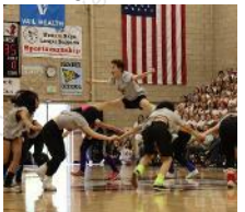
It's Tricky- Run-DMC