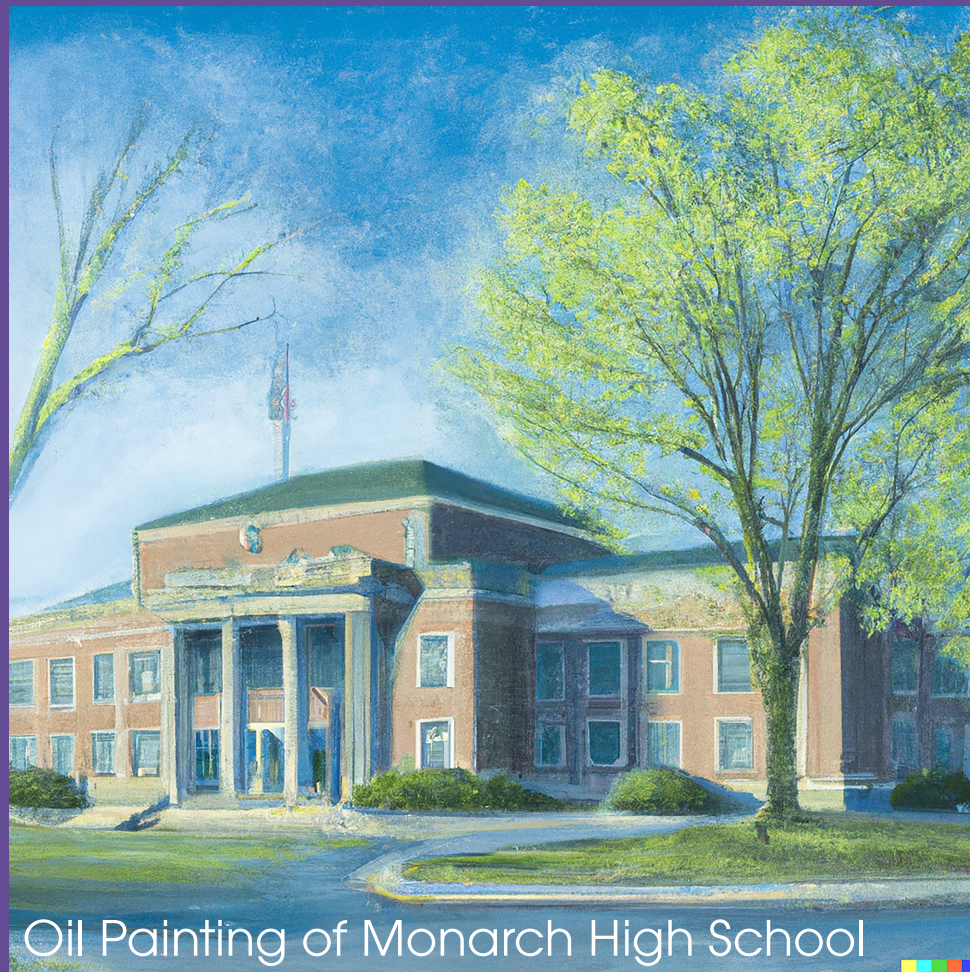
Oil Painting of Monarch High School

WITH THE CONSTANT EVOLUTION OF ARTIFICIAL INTELLIGENCE, CHATGPT RAISES QUESTIONS AND CONCERNS ABOUT THE POSITIVE AND NEGATIVE INFLUENCE IT WILL HAVE ON LEARNING AND EDUCATION