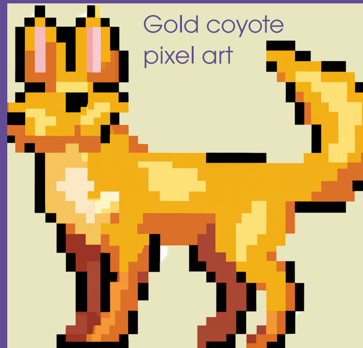
Gold coyote pixel art