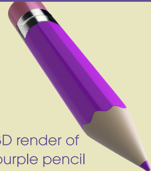
A 3D render of a purple pencil