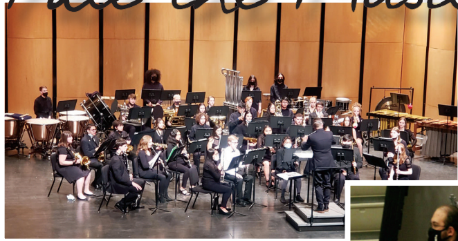
PERFECTING THEIR PERFORMANCE During the winter band concert, they are performing one of their many songs they have memorized and perfected.