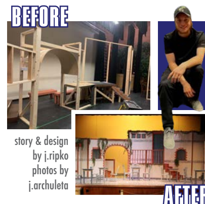
story & design by j.ripko