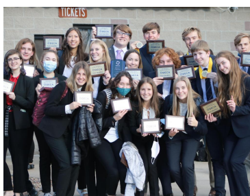
Winter dancing with the teachers