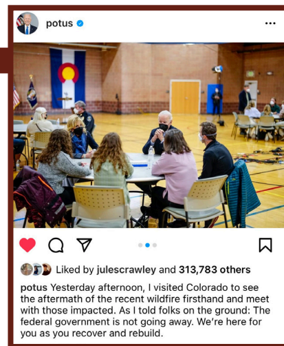
potus Yesterday afternoon, I visited Colorado to see the aftermath of the recent wildfire firsthand and meet with those impacted. As I told folks on the ground: The federal government is not going away. We're here for you as you recover and rebuild.