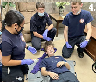
Photos courtesy of EHS students attending Career Academy