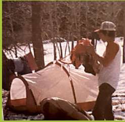
1984 Outdoor Ed Trip