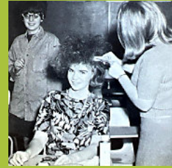
1968 Father of the Bride Production