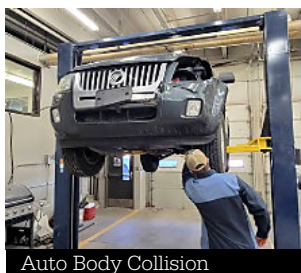
Auto Body Collision

Students went to Pikes Peak Community College to learn and work on cars for Auto Body Collision.