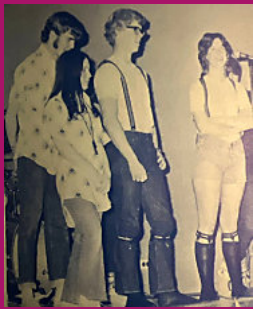
1973 Sock Stomp