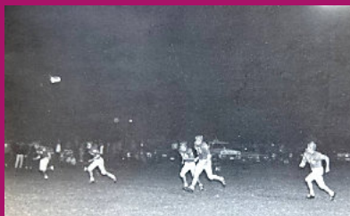
1968 Football Game