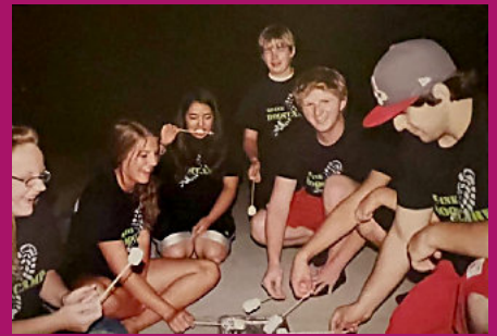
2013 Journalism students roast marshmallows during summer staff training