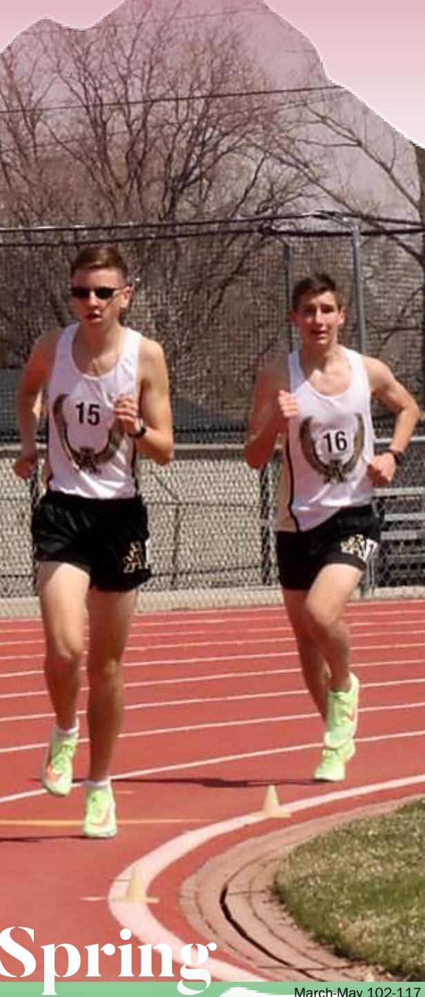
March-May 102-117 Prom 118-119 Spring Sports 120-129