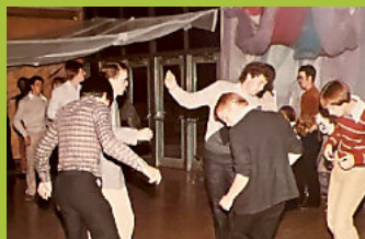
1984 Homecoming Dance