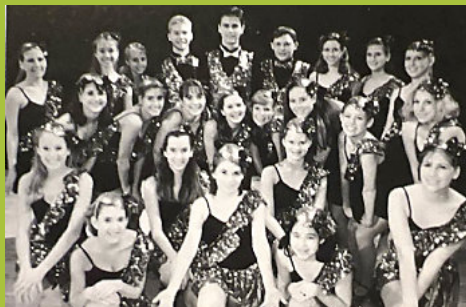
1995 42nd Street Production