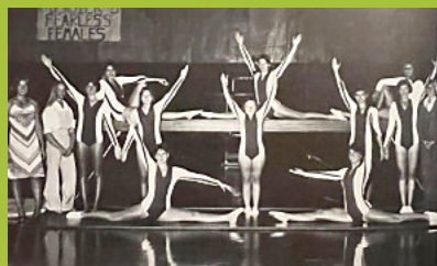
1978 Gymnastics team