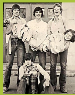
1977 Fire Chiefs

Customer is allowed to have objects outside of the margin.