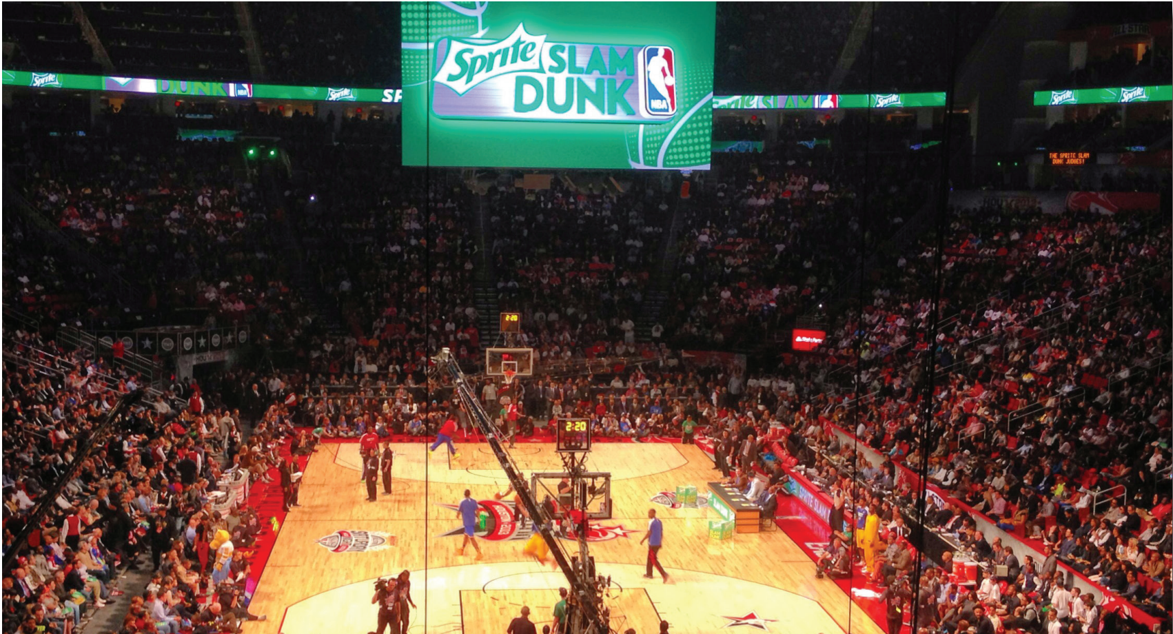
The NBA hosts its annual Slam Dunk Contest in 2013 at Toyota Center.