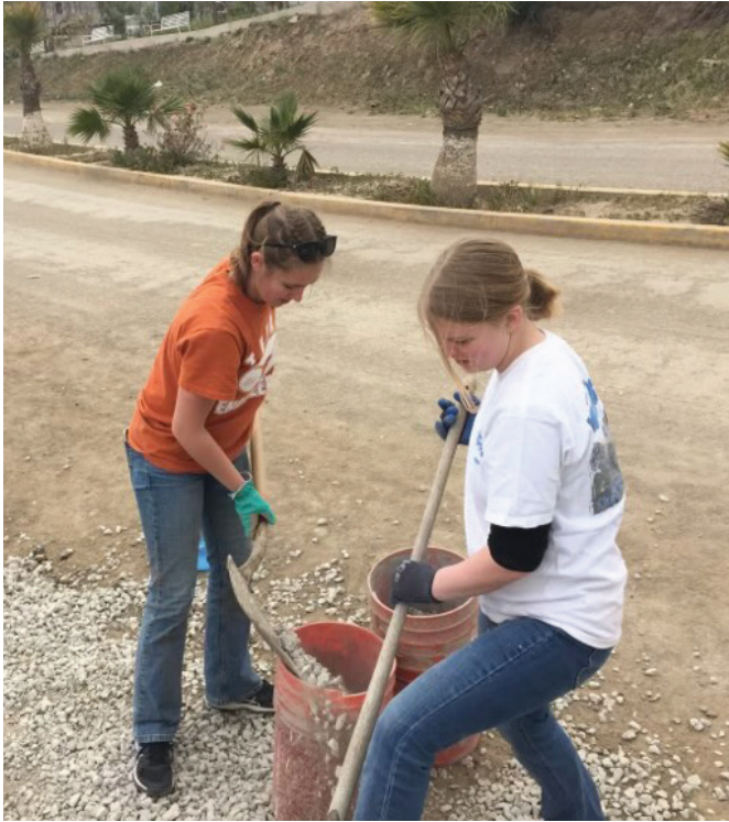
A group of students take part in a mission trip to Mexico to help build a house for the community during February break.

breaks is controversial throughout Delta High School. It is important to understand and discuss the positive and negative effects.