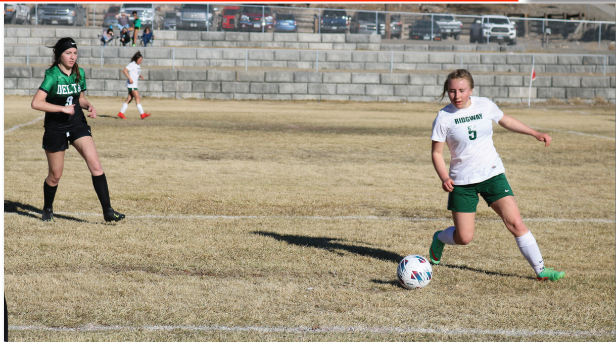
GOAL FOR GIRLS' SOCCER: Girls' varsity soccer plays Ridgway and takes the game with a total score of 5-0. The girls are kicking it at 1-2 overall. Their losses go to Grand Junction and Montrose High.