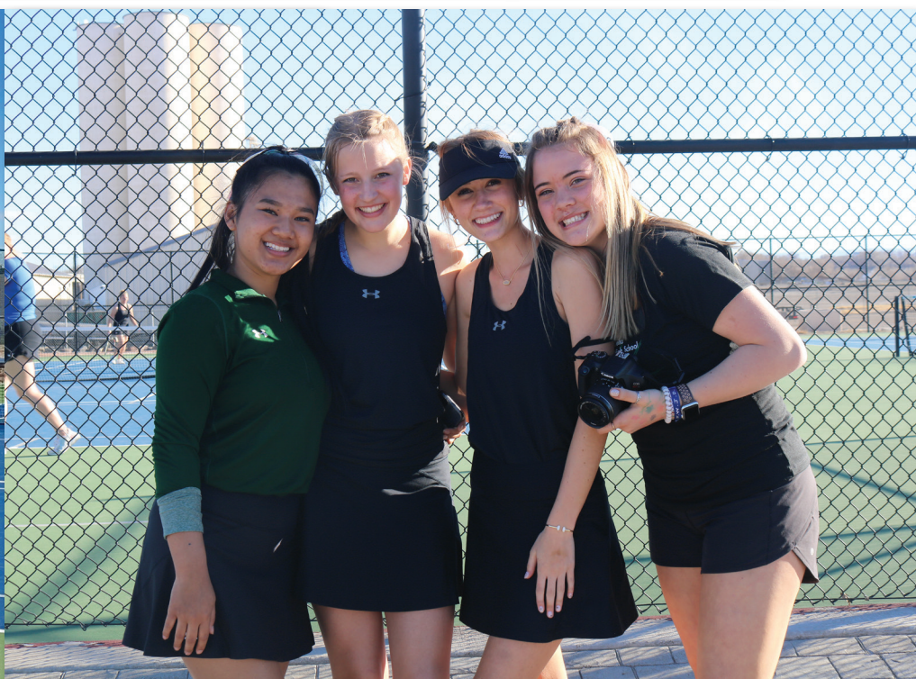
TENNIS, LOVE: Varsity tennis serves an amazing start. The double teams played amazing, not dropping a single set across eight matches. Singles did extremely well along with the team. As of right now, the team is sitting with an overall of 4-1.