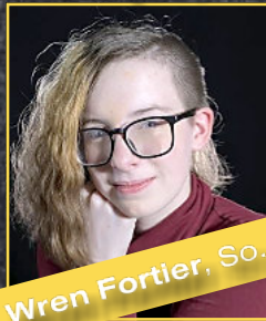
"Show Choir, but counted as a PE credit."