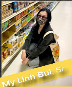
"Racism and inequality in America."