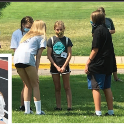
JUST GETTING STARTED AS MIDDLE SCHOOLERS