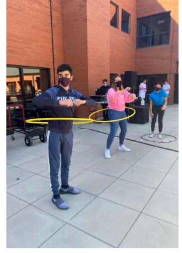
Space Block Party As fun as the Spirit Days are, a truly Out of This World Homecoming wouldn't be complete without music and games! Students competed in Hula Hoop competitions for Raptor gear and danced to the music as they celebrated Spirit Week and getting to be together.

Coverage by Malia Logan