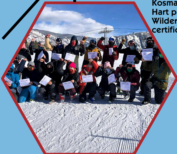
66 The AMGS class with their PSIA certifications.