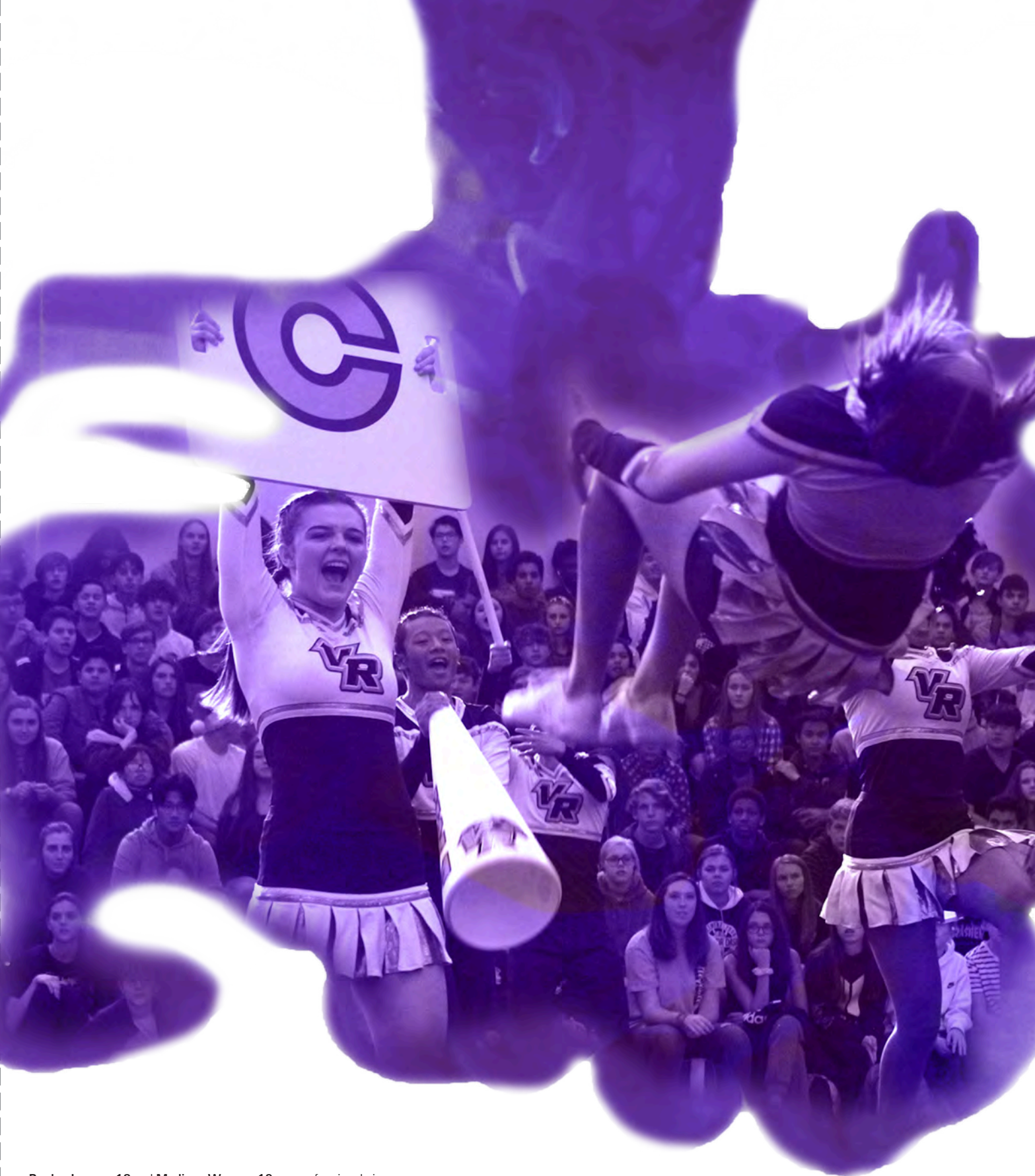
Baylea Larson, 10 and Madison Warner, 12, are performing their routine for the winter pep rally one last time before they head up to perform at state.