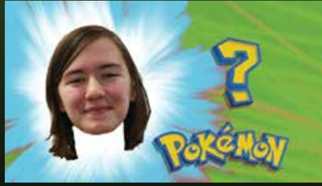
"I picked Umbreon because it's the dark type evolution of Eevee. Because I'm usually in tech I'm always in black and in the dark. I also just love Umbreon I think its such a cool evolution"