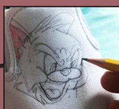
Step 1: Pettis sketches the design in pencil on the shoe.