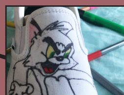
Step 3: Pettis colors in the design with pens