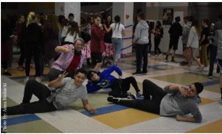
Valentines Vibes Cresthillians show off their great moves and strike some awesome poses.