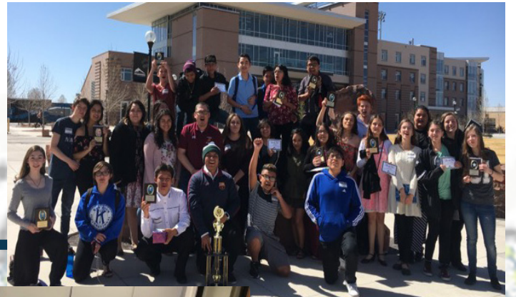
Felices Los Cinco - Five of our proud students smile as they support Alamosa High school in a speaking competition at World Language Day.