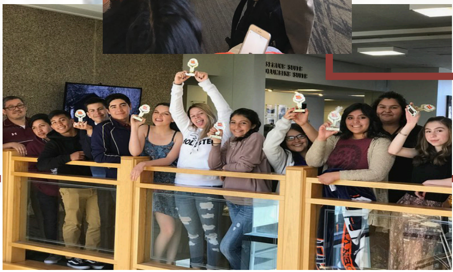
Eye of the Tiger - Students that competed in World Language Day were determined and kept their eye on the prize. Although Alamosa High School was the smallest school competing they were able to get second place.