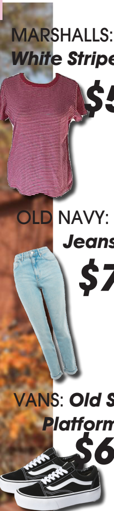
MARSHALLS: Red & White Striped Polo