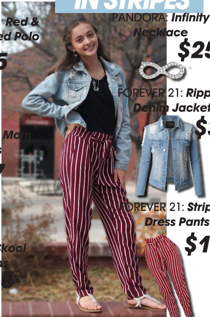
PANDORA: Infinity Necklace