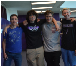
Story and photo by Sunae Bruce

"We get to pick our own songs and are completely self oriented, so if we feel like a song is too hard we can just pick a different song or just change the key of it, and it makes it a