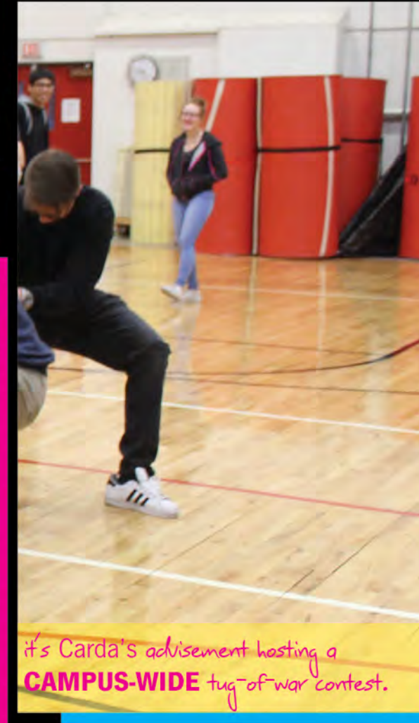
it's Carda's advisement hosting a CAMPUS-WIDE tug-of-war contest.