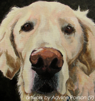
artwork by Adylene Poirson (9)