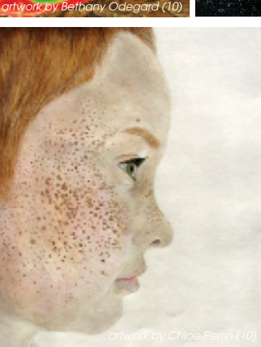
artwork by Chloe Perni (10)