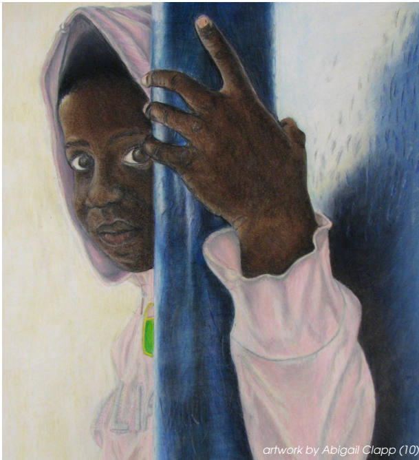
artwork by Abigail Clapp (10)