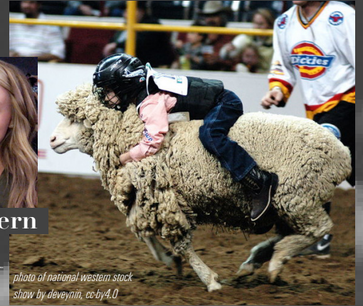
photo of national western stock show

On the opening night of the stockshow, the first event was the Team Colorado vs The World Team Cinch Competition which was the major headline