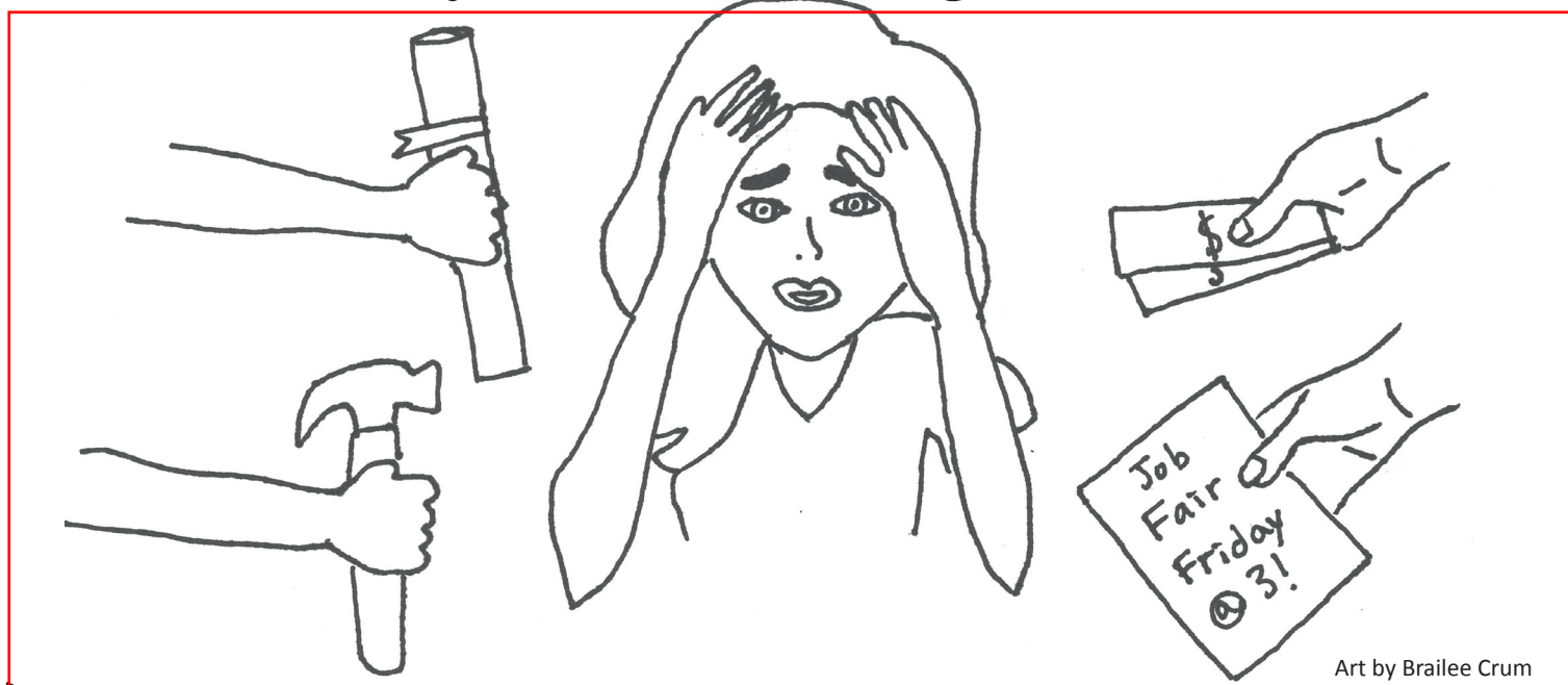
Art by Brailee Crum