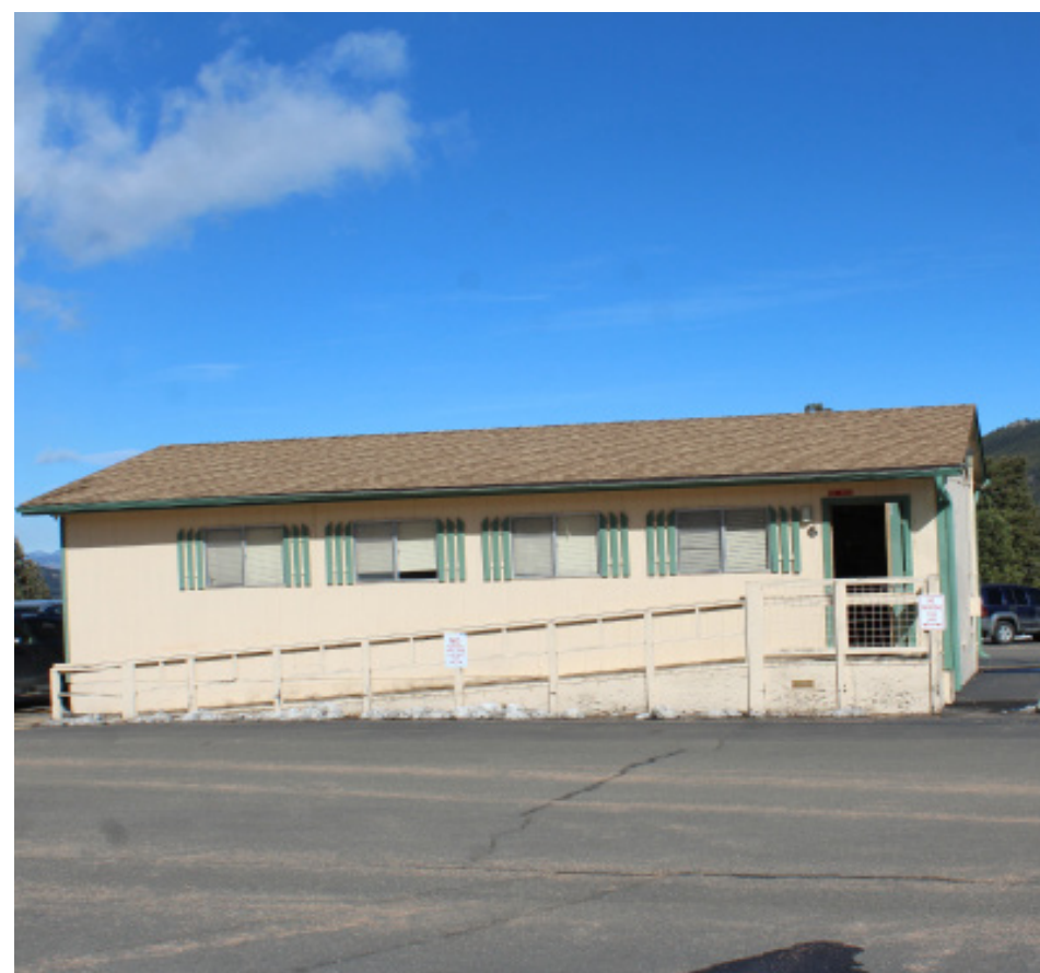
With its door open, the math hut sits on the outskirts of the school parking lot. Students in the class make the trek to the outside building every day they have the class, an experience that most high schoolers don't have.