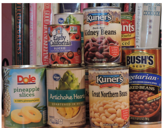
Canned foods such as beans, soups, and meats are great options to donate for this year's EVHS food drive.

While several events have already been put on by Student Council this year,