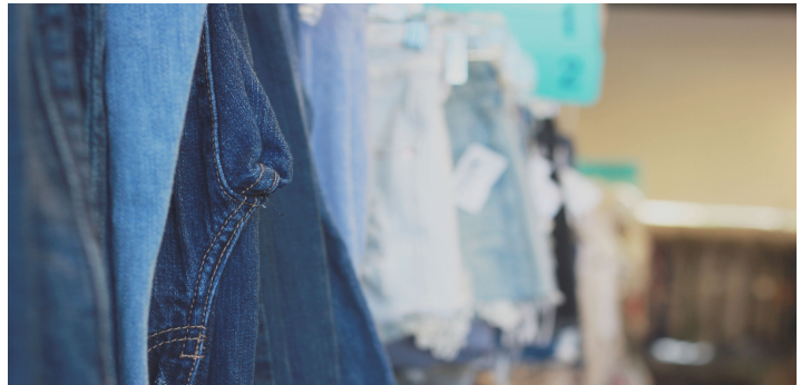
A display of women's denim jeans and shorts at Plato's Closet. Thrift stores offer an array of choices for shoppers.

revamp old clothes and make them something fun and new. If you're looking to just buy it, wear it, and not have to turn it into something else, I would try a store a little more up to par. I left the store and moved on to the next one, one that is put together a lot differently than Goodwill.