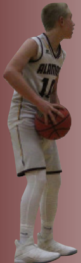
Boys Basketball Page 12